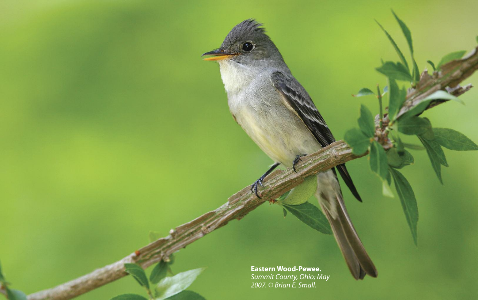
Eastern Wood-Pewee. Summit County, Ohio; May 2007.

F ast-forward 23 years, to 1987. The birding bug has bit me. I'm playing a Roger Tory Peterson bird song LP, dubbing it to cassette tape so I can learn the contents. I may have missed the narrator's voice telling me the species name—"Eastern Wood-Pewee"—but the song hit me like a ton of bricks: Pee-ah-wee! Peeeee-weeee . My mind reeled, the room spun, and I fought for equilibrium. My mother's "All Leskiws come home" cry: She'd gotten it from a bird!